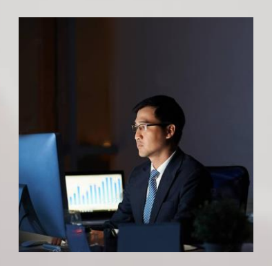
Enterprise Mobility & Security